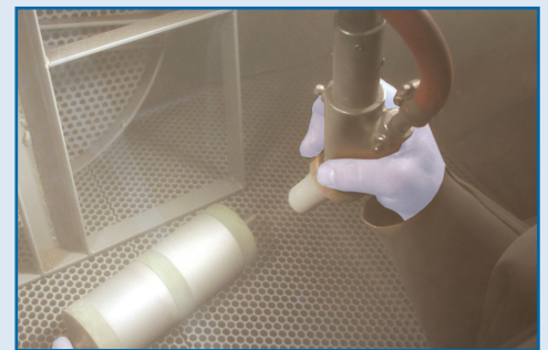
Green Belting Industries tapes, fabrics, and compounds can often be applied once for both grit and spray coating.

Further costs arise if parts must be masked twice, once for grit blasting (surface preparation) and again prior to receiving the spray coating. Use of high-quality Green Belting Industries thermal spray masking materials can eliminate all of these added costs.