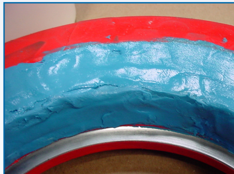
HVMC – High Velocity Masking Compound