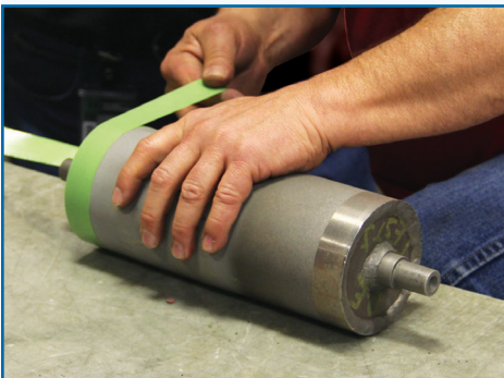
170-10S Green Masking Tape