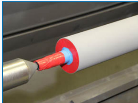
170-10S Red and HVMC – High Velocity Masking Compound (blue)