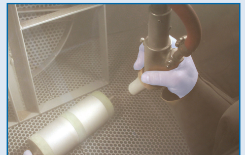
Green Belting Industries tapes, fabrics, and compounds can often be applied once for both grit and spray coating.

Further costs arise if parts must be masked twice, once for grit blasting (surface preparation) and again prior to receiving the spray coating. Use of high-quality Green Belting Industries thermal spray masking materials can eliminate all of these added costs.