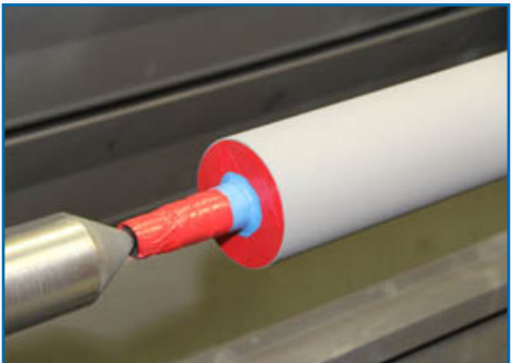
170-10S Red and HVMC – High Velocity Masking Compound (blue)