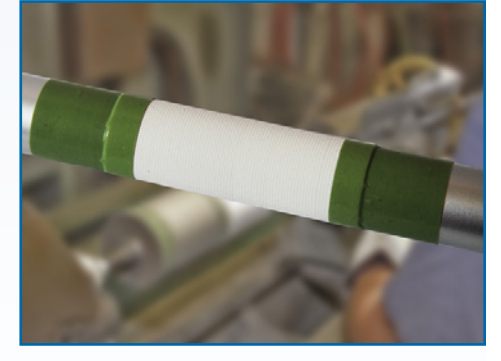
170-10S Green Masking Tape with SW-35 Silicone Coated Fiberglass Fabric (white)