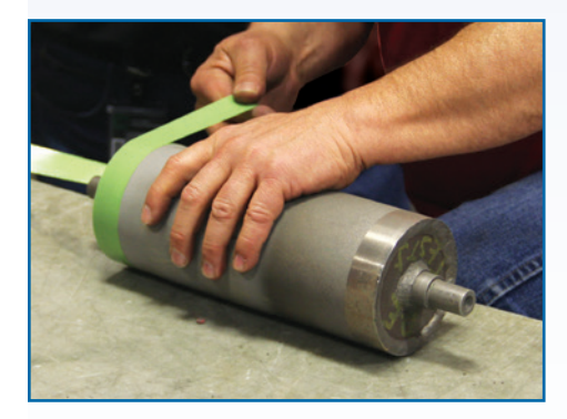
170-10S Green Masking Tape

• For secondary masking, SW-35 thermal spray masking blanket (silicone coated glass fabric) can be deployed to protect against overspray. This material is reusable for many cycles.