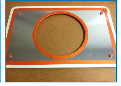
HVMT Orange Masking Tape