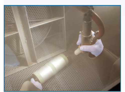
170-10S Green Masking Tape

HVMC - High Velocity Masking Compound HVMT - High Velocity Masking Tape