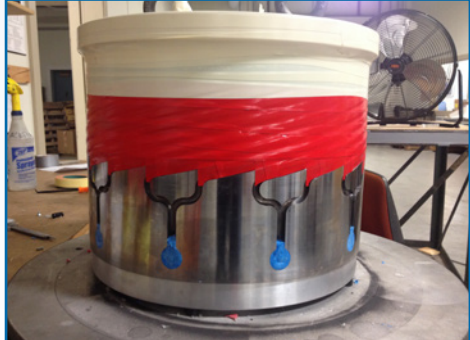
170-10S Red and HVMC – High Velocity Masking Compound (blue)