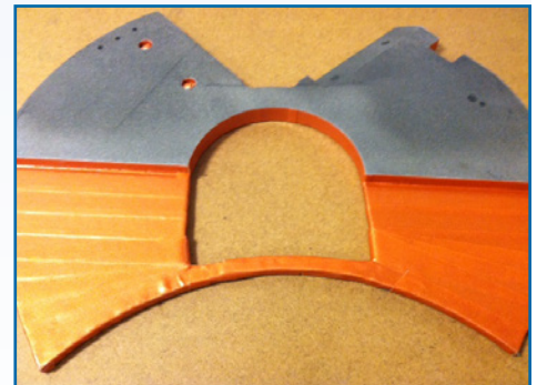
HVMT Orange Masking Tape