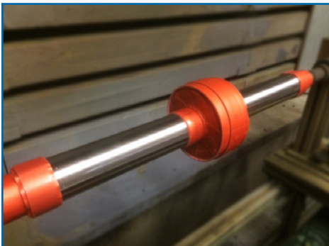
HVMT Orange Masking Tape