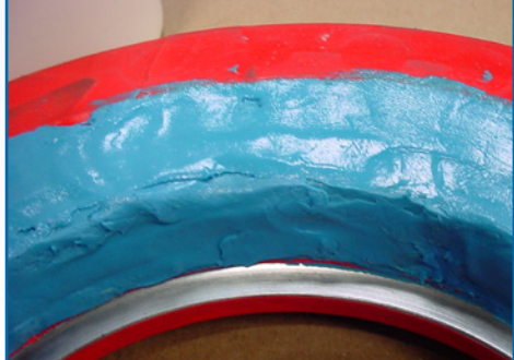
HVMC - High Velocity Masking Compound