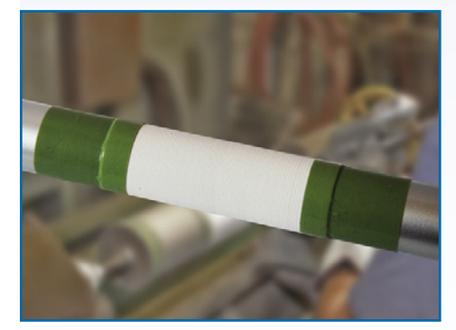
170-10s Green Masking Tape and SW-35 Masking Fabric