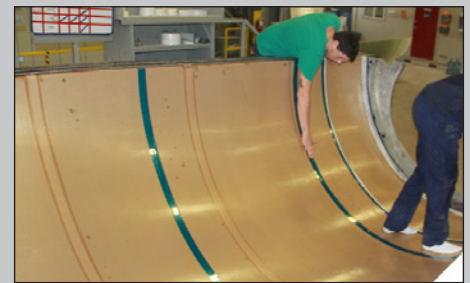
Wind turbines have greatly increased in recent times.

For higher pressure areas and common 'wear points' 100-6S can serve as a lower cost 'sacrificial' mould release solution.