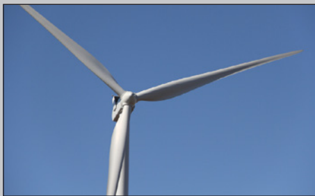
Wind turbines have greatly increased in recent times.