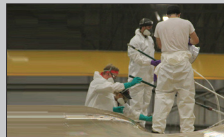
Many solvent based release agents are potentially harmful to the personnel who use them.