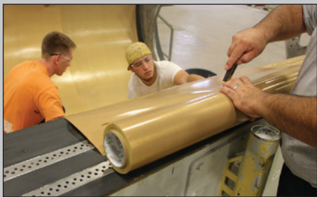
GR6 Mould Release is a premium reinforced PTFE product developed for the wind blade market.

GR6 can last up to 40 cycles and beyond before replacement is necessary.