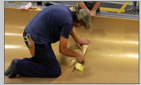
Wind turbines have greatly increased in recent times.

GR6 can last up to 40 cycles and beyond before replacement is necessary.