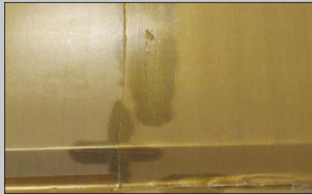
Premature damage occurs in the root where the blade is heavier and of more extreme geometry.

During wind blade production, there are situations that may result in premature damage to the GR6 mould release layer. This damage usually occurs in the root where the blade is much heavier and of more extreme geometry. Green Belting produces a range of PTFE based mould release products that can be used as 'sacrificial' mould release solutions in conjunction with GR6 to provide more economical options for more demanding areas and when liner repairs are required when premature mechanical damage occurs.