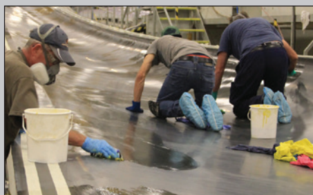
De-moulding and / or post processing can increase cycle times and labour costs.

The wind turbine blade manufacturing community has in the past relied on mould release products that have not always delivered the degree of production performance and mould protection sought after.