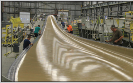
Application of PTFE mould release can be consistent from root to tip..