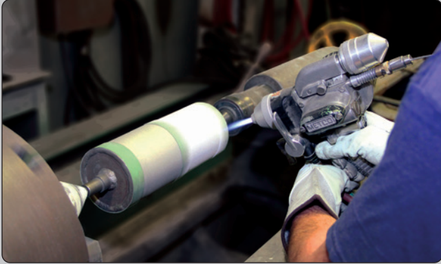
Manual application of combustion spray using a handheld spray gun.

If longer dwells (possibly due to the component small size) exist, then the operator should consider using 170-10S Red. If the component surface temperature is expected to exceed 500°F (260°C), then multiple layers of 170-10S Red will be required.