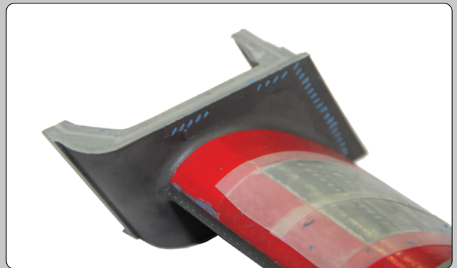
The numerous small holes in this turbine fan blade can be quickly and effectively masked using High Velocity Masking Compound.

Many aviation engine vanes and components found in the hot combustion zones of the engine contain very small holes on the surface to assist with controlling the temperature of that part while in service. Generally, operators try to protect cooling holes so that coating and grit does not penetrate and build up. Masking cooling holes is difficult and time consuming. The best solution for masking cooling holes is using High Velocity Masking Compound (HVMC). This masking technique involves mixing the compound to a 50:50 ratio then spreading and filling in the holes. The putty can be trimmed and the surface cleaned only after curing is complete (7 minutes). After the compound is cured, grit blast is required to etch and clean the surface of the component prior to the application of the flame spray coating. Once the coating process is complete the putty can be burned out of the hole at 1000°F (540°C) for one hour.