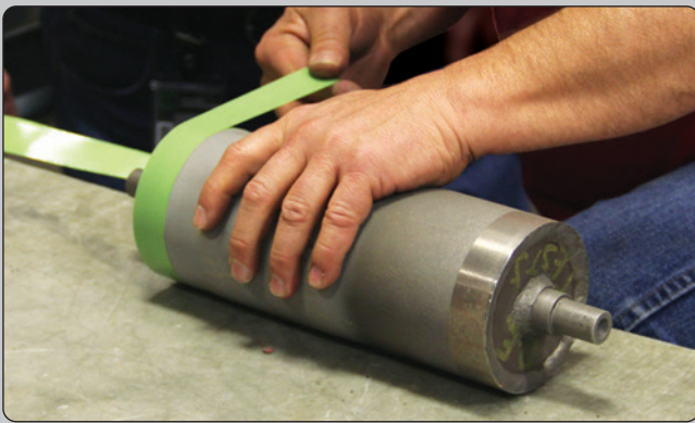
Applying 170-10S Green Masking Tape to a cylinder prior to receiving combustion spray coating.

Thermal spray masking tapes are typically constructed with silicone rubber, woven fiberglass, metal foils, and silicone adhesive.