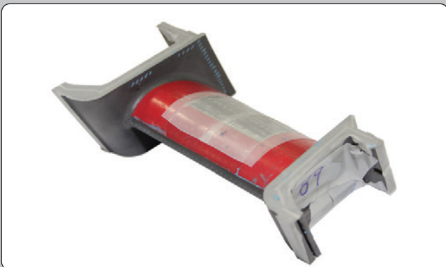
A turbine blade is masked with 170-10S (Red) and 160-5S (White) Masking Tapes as primary and secondary masking, respectively.

Intricate profiles are more challenging and require a good masking plan. Small, intricate parts and profiles will require a conformable (flexible) masking material such as single layered tapes. The most flexible tapes for Flame Spray processes are the 190-7S, 160-5S HT, 162-7S, and 170-10S YL followed by the 170-10S Red. If the component is small and there is potential for dwelling of the flame, then the 170-10S Red is the appropriate choice to delay burning or distortion of the masking tape.