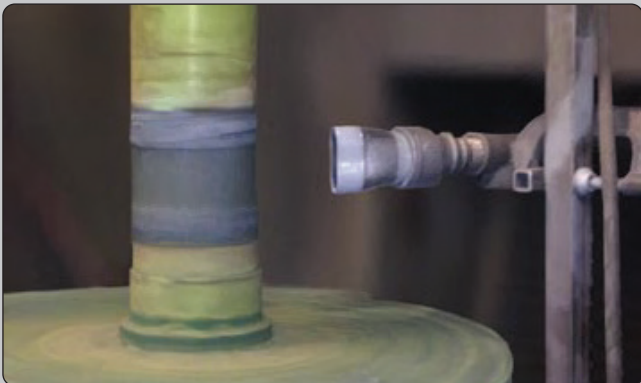
Quality masking products such as this 170-10S (Green) Masking Tape will withstand both the surface preparation and thermal spray coating processes.

There are situations where air cooling is not possible and/or not practiced which makes masking far more challenging since a lack of air cooling will significantly raise the substrate temperature especially if the component being sprayed is small. The best option for masking smaller parts with no air cooling is the 170-10S Red plasma spray masking tape or HVMT Orange high velocity masking tape. Both of these products will exhibit flame retardant characteristics and self-extinguishing properties. These products, when used in multiple layers (at least two) should be enough to survive the process while removing cleanly from metal surfaces.