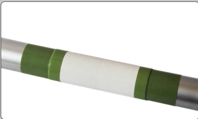
SW-35 Masking Blanket is used as secondary masking to mask larger areas, and is reusable.

Large areas with difficult profiles should utilize fabric and tape together for the most cost effective solution. Small areas should generally use a pressure sensitive plasma spray masking tape such as 170-10S Green.